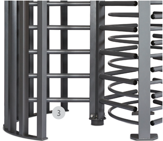
Rubberized bottom arm (3), provides impact protection to the user. Treatment and finishing allow for outdoors installation.